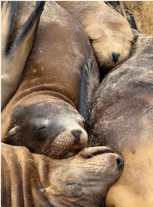
15 - Sleeping Sea Lions (Zalophus Family Otariidae)