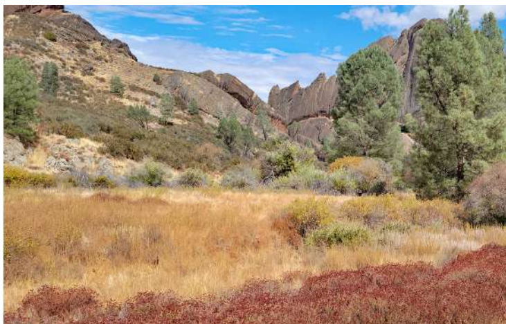
08-Fall Splendor at the Pinnacles