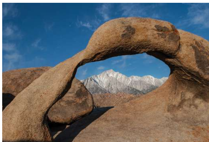
Mt Whitney from Alabama Hills