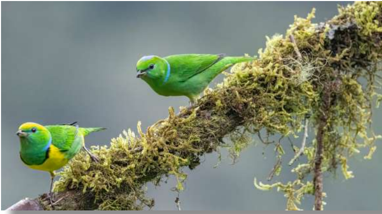
07 - Male and Female Golden-browed Chlorophonia