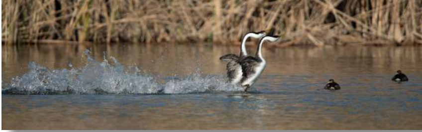
16-Western Grebes Rushing