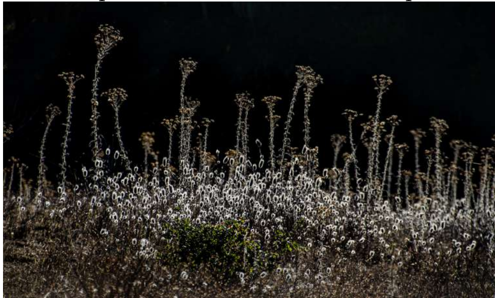
First Place - 10-Ragweed at Fort Ord Jared Ikeda