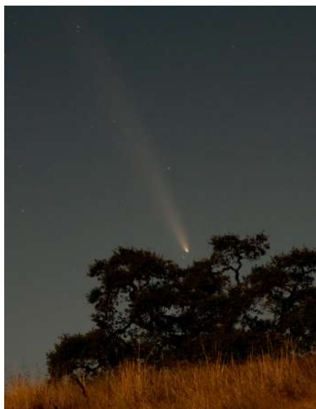
03-Comet Suchinshan, Atlas A3