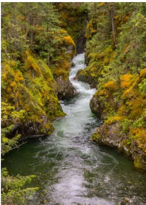
12-River Slalom to Little Qualicum Falls