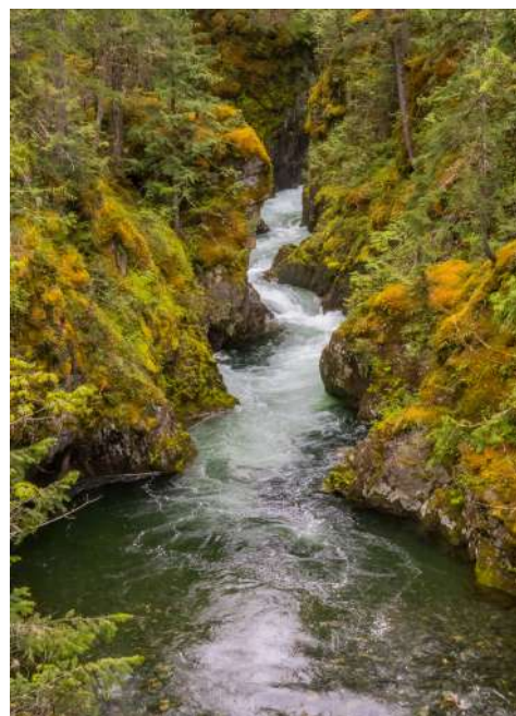
Third Place - River Slalom to Little Qualicum Falls Rick Verbanec