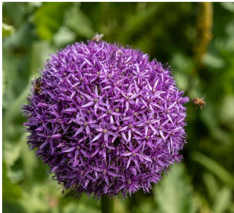
Allium Globemaster Dick Light