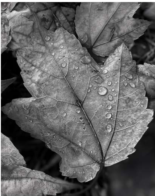
12-Red Maple, Acer rubrum