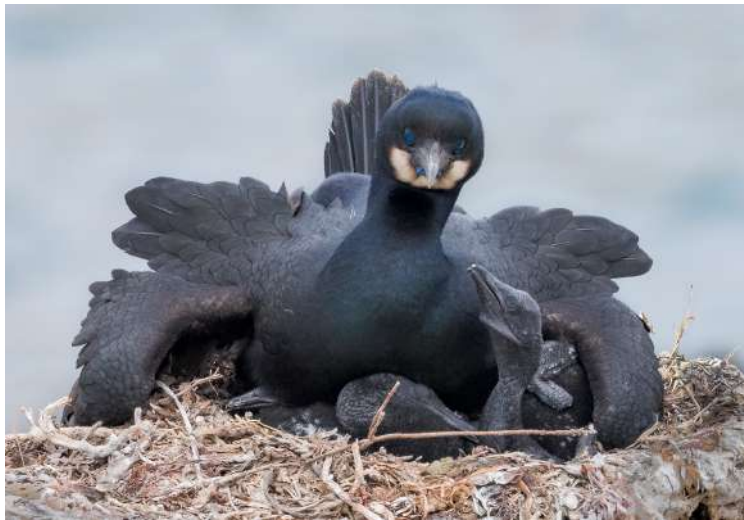
01 - Brandt's Cormorant (Phalacrocorax penicillatus)