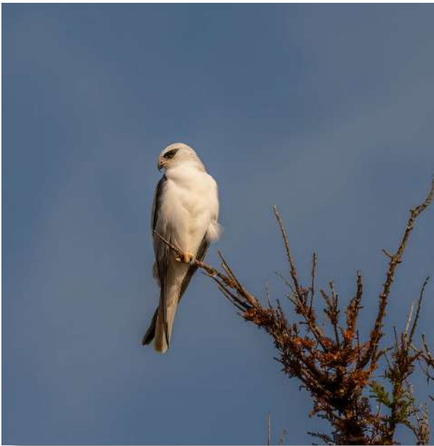
16-White Tailed Kite