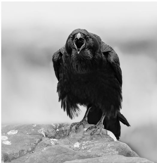
Second Place - Common Raven Sara A Courtneidge