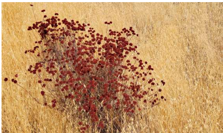
07-Erigeron in Field of Golden Grasses