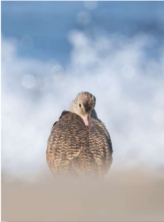
13 - Resting Marbled Godwit (Limosa fedoa)