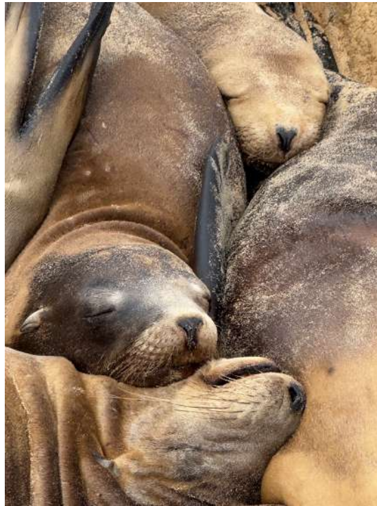
First Place - Sleeping Sealions Carol Silveira