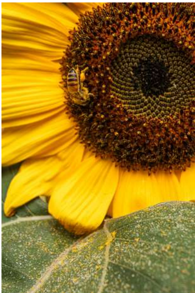
06-Honey Bee Gathers Pollen from Prolific Sunflower