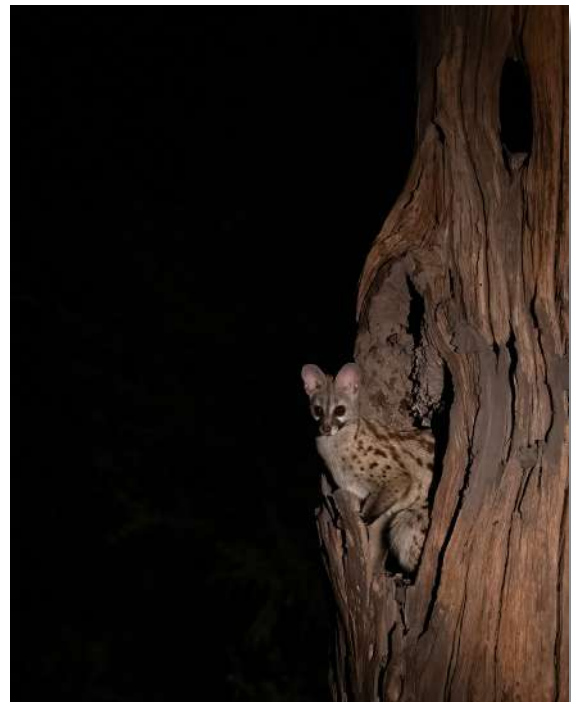
Third Place - 14-South African small-spotted Genet (Genetta felina) inside Tree Burrow Karen Schofield