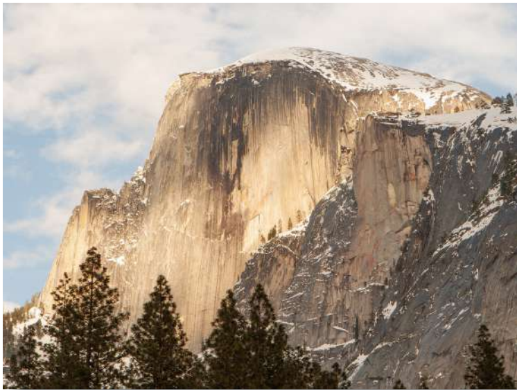
04 - Half dome