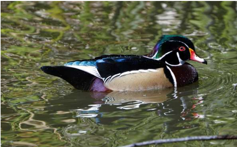
17-Woodie the Wood Duck