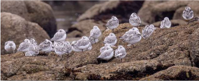
16 - Western Sandpiper Grouping (Calidris mauri)