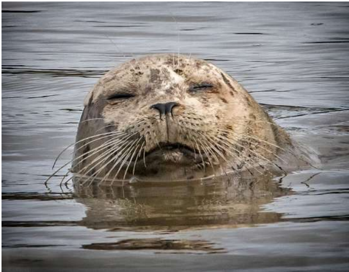
14-Sleepy Seal - Phoca vitulina