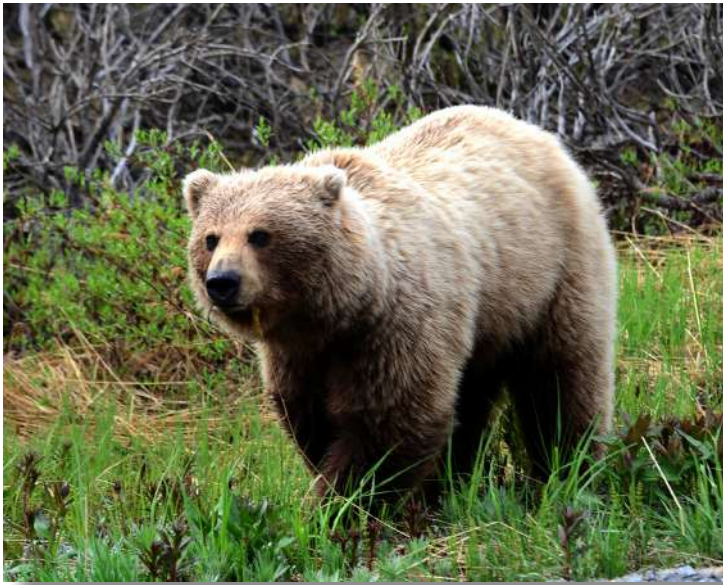
10-Grizzley in Denali Natl. Park