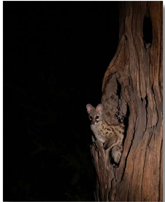
14-South African small-spotted Genet (Genetta felina) inside Tree Burrow