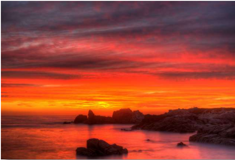
11-Red and Orange Sunset