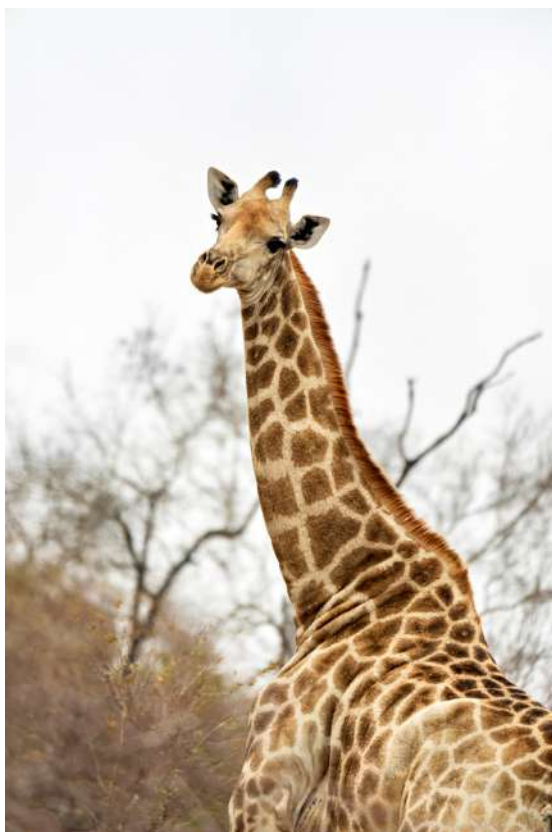
09-Giraffe in Kruger South Africa Sept 2024