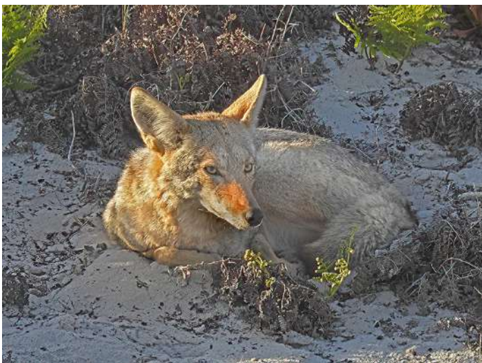
06-Coyote at rest - Canis latrans