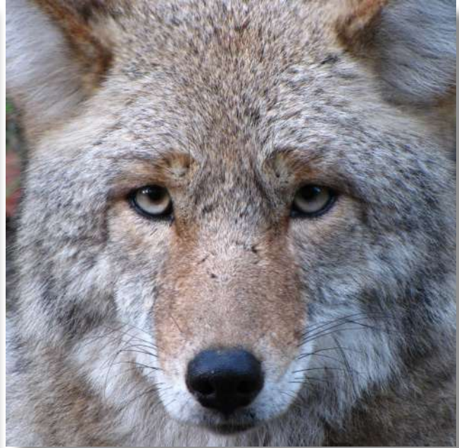
04-Coyote (Canis latrans) in Yosemite Sandie McCafferty