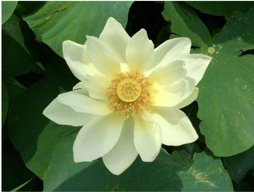
Sacred Lotus in South Korea