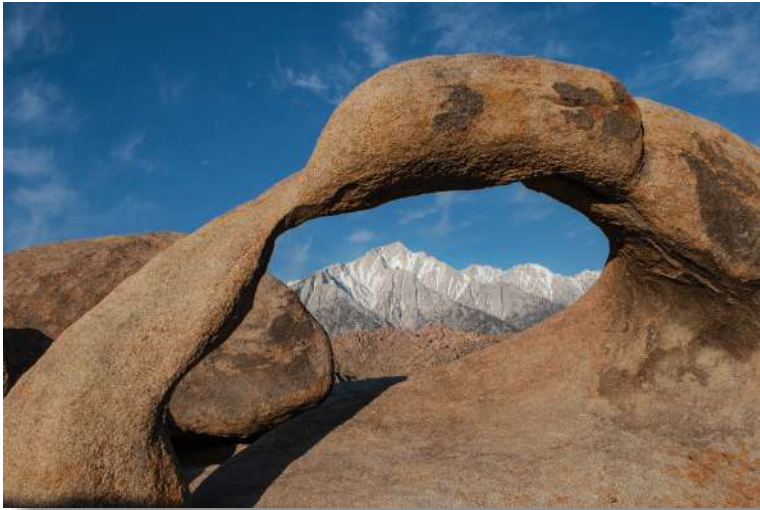
10 - Mt Whitney from Alabama Hills