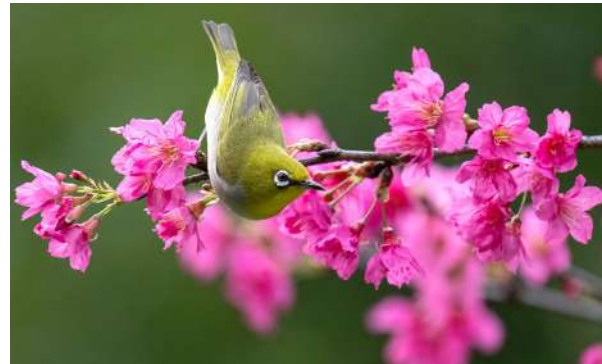
Japanese White-eye in Plum flower Julie Chen