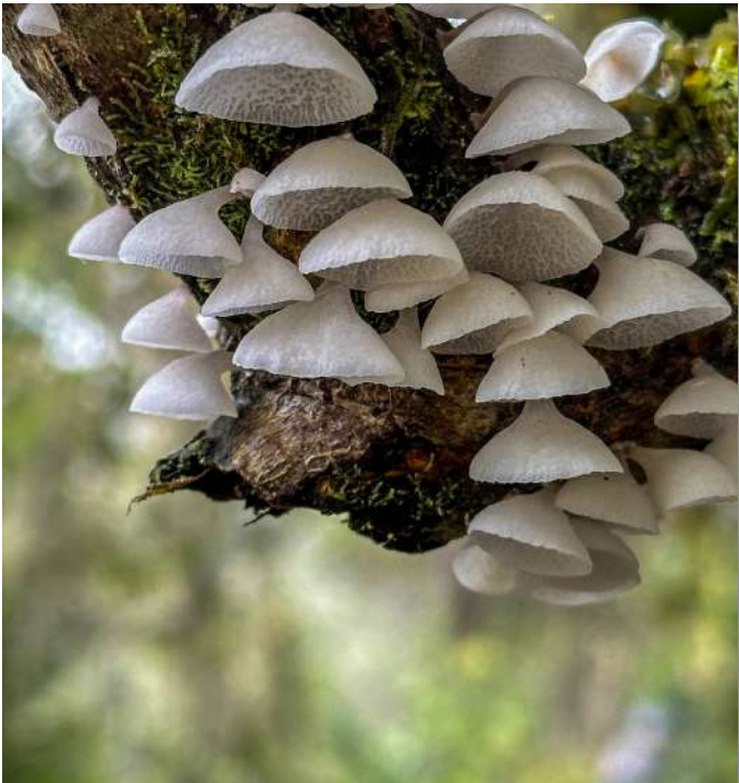
09-Porodisculus pendulus Mushrooms