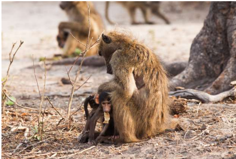
01-Baboon (Papio ursinus) Grooms Juvenile