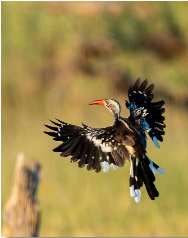
13-Red-billed Hornbill (Tockus erythrorhynchus) Takes Flight