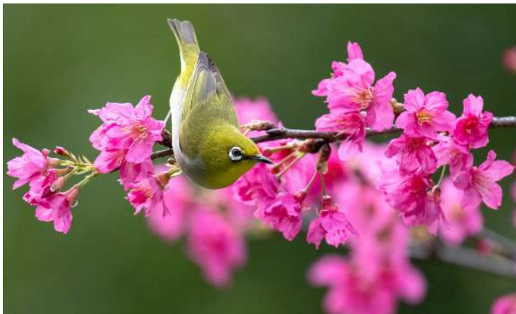
05 - Japanese White-eye in Plum flowers.