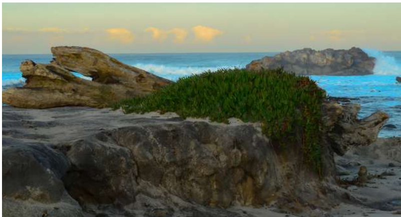
02-Colors of Asilomar