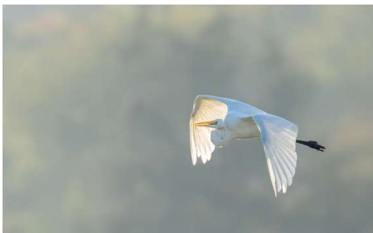
03 - Great Egret in Flight