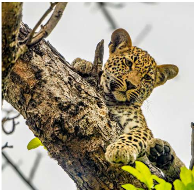
03-Baby Leopard in a tree in Kruger South Africa Sept 2024