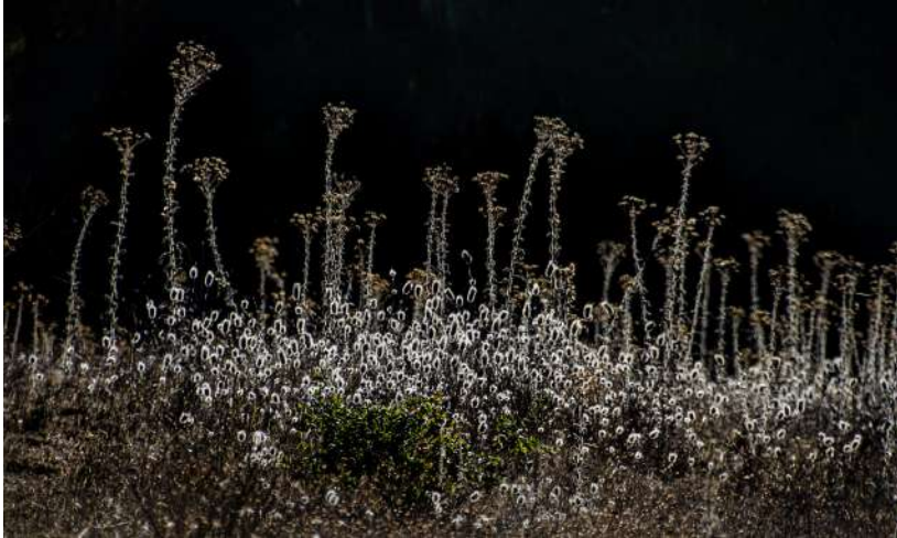
10-Ragweed at Fort Ord