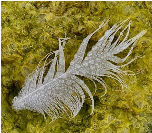
05-Gull Feather in Gut Weed