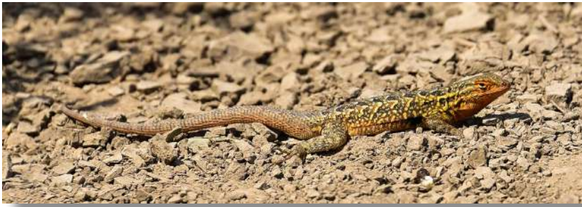
07-Lizard of Carizzo Plains