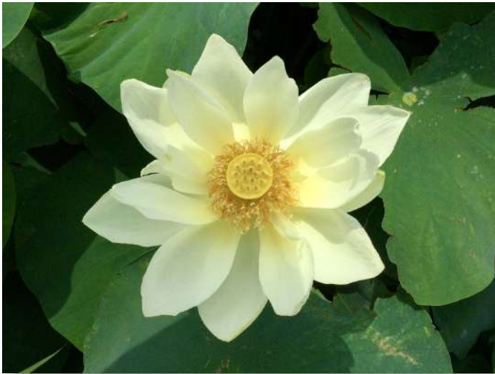
13-Sacred Lotus in South Korea