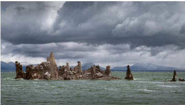
09 - Mono Lake in May