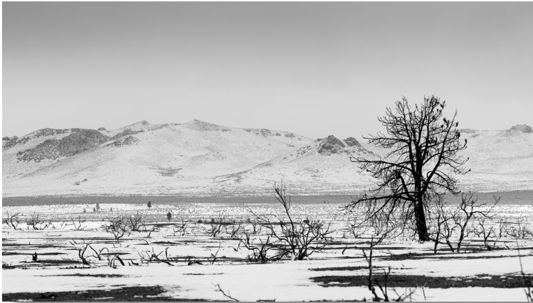
11 - Nowhere, California