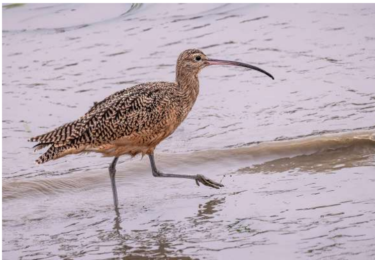
06 - Long-billed curlew (Numenius americanus)