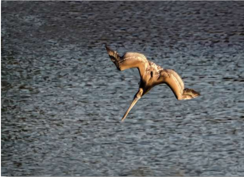
08-Pelican Dive Bomber