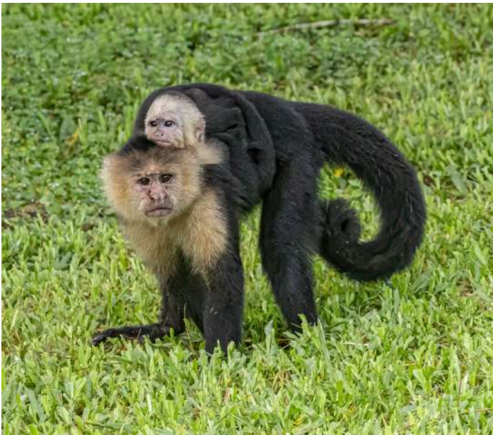
08 - Mom and Baby White-faced Capuchin