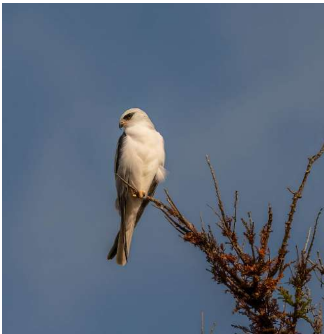
Second Place - White Tailed Kite Dick Light