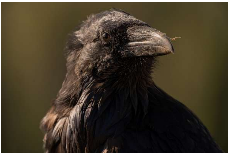
12 - Portrait of a Raven (Corvus corax)